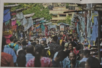
People of various faiths attend the Mount Mary Festival to pay homage to Mother Mary who was born on September 8. The fair will take place between September 8 and 15.