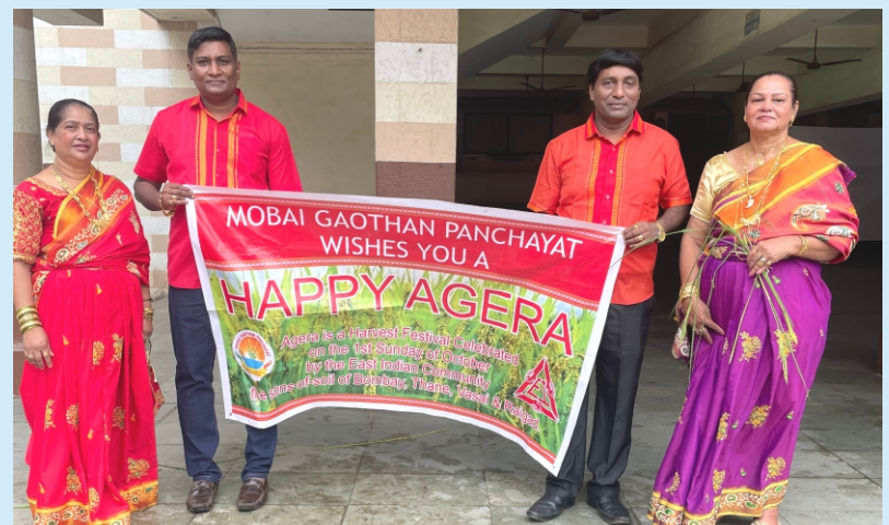
Parish - St. Francis Xavier's Church Gaothan - Kanjur