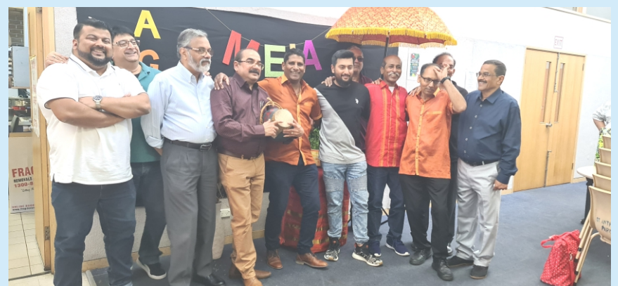
Parish - St. Anthony Church, City - Melbourne, Country - Australia Organised by - Melbourne East Indian Association