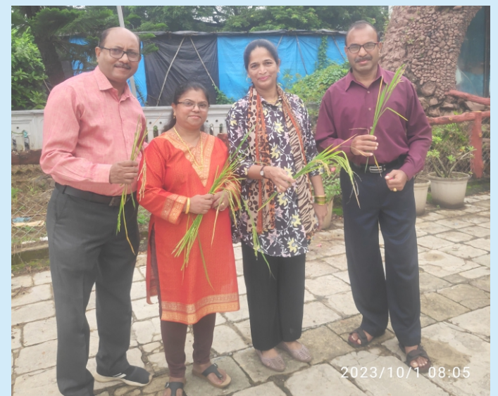
Parish - Our Lady of Grace Cathedral, Papdy Village - Papdy, Goathan - Vasai Organised by - PPC.