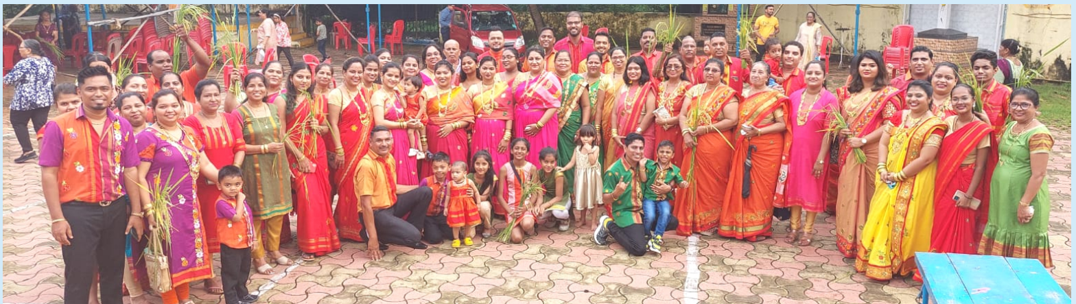
Parish :- Infant Jesus Chapel - St. Anthony's parish Village - Kharodi & Rathodi Gaothans Organized by:- Parish Council Members.