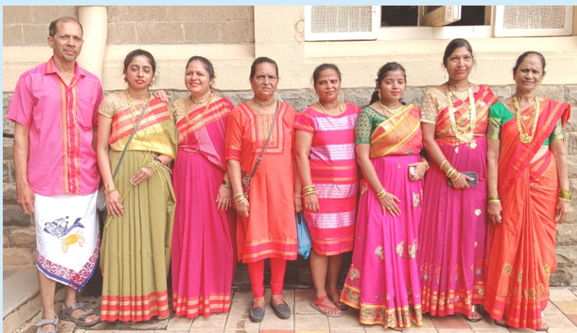
Parish - St. Peter's Church Village - Bandra, Gaothan - Chapel Road Organised by - Confraternity