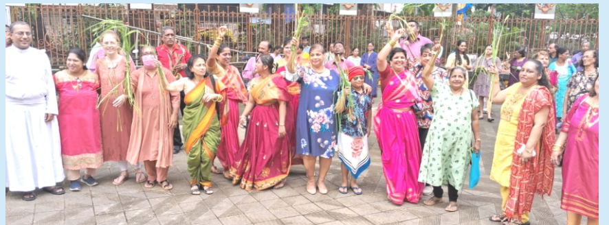
Parish - St Blaise Church Goathan - Amboli, Kevni, Andheri & Tape Organized by - PPC