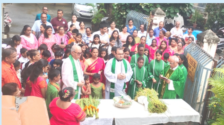
Parish - St. Andrews Church Village - Bandra, Goathan - Chimbai Organised by - PPC & SCC Members of Chimbai