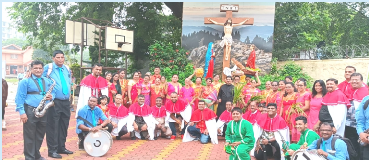
Parish - Our Lady of Egypt Gaothan - Kalina Kolivery & Big Village Organised by - Kolverey Welfare Association