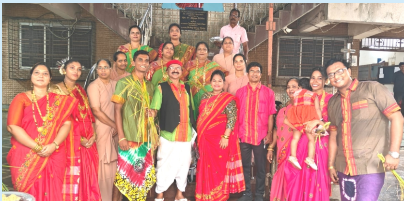
Parish - St. Anthony's Church Village - Dharavi Gaothan - Dharavi Koliwada