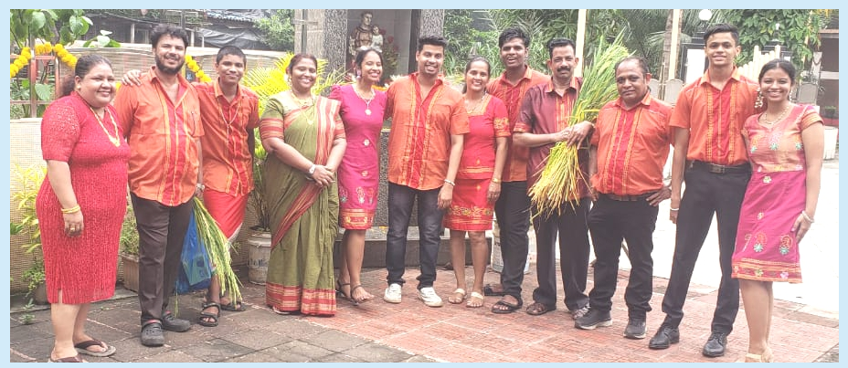
Parish - St. Anthony's Church Village - Mankhurd, Goathan - Govandi & Mankhurd Organised by - MGP Vibhag Unit - Mankhurd & Govandi