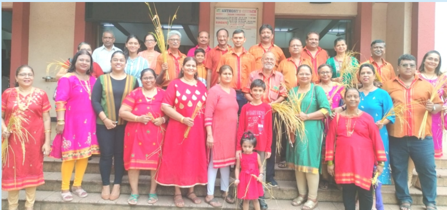
Parish - St Anthony's Church Goathan - Vakola Organised by - Vakola East Indian Association