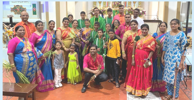
Parish - St. Anthony's Church Village - Malad Gaothan - Marve & Malvani