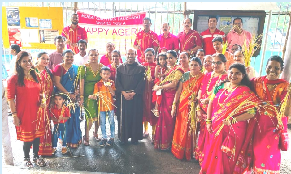
Parish - Our Lady of Good Counsel Village - Sion Goathan - Agarwada, Bhandarwada & Laxmi Baugh Organised by - Sion mulgami welfare association