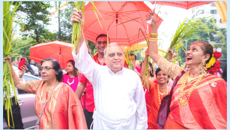
Parish - Our Lady of Lourdes Goathan - Orlem