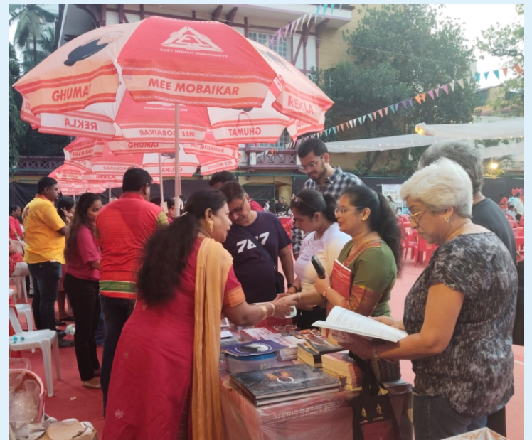
MGP Stalls at the East Indian Festival organised by Bandra Gymkhana