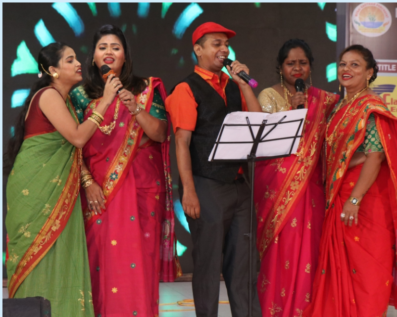
Performance East Indian Mumbai Masala Song