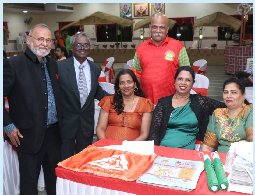
MGP Welcome Desk