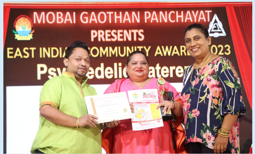
Sandra Gomes Memorial East Indian Caterer of the Year Psychedelic Caterers