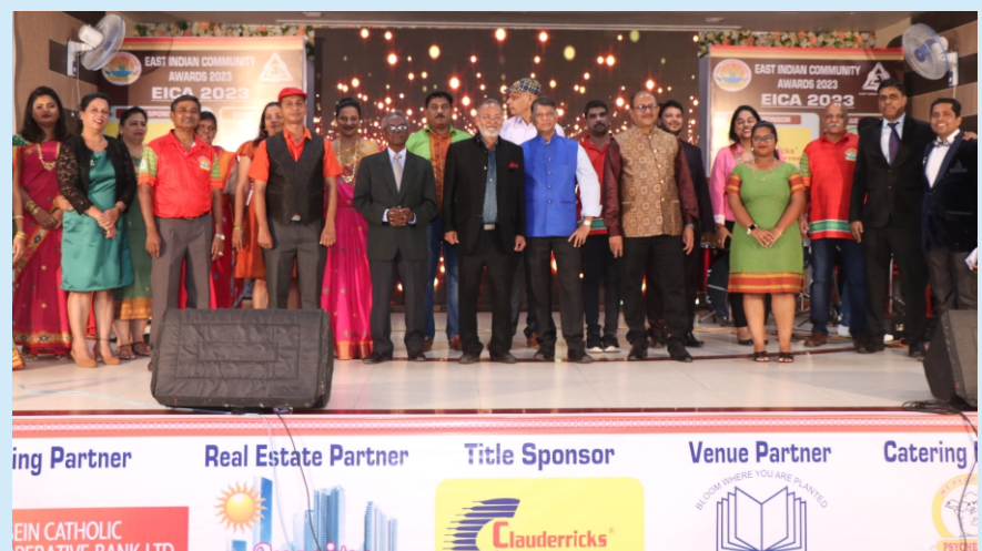
MGP Team at the Awards Ceremony