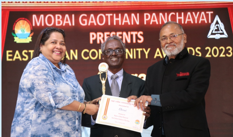
Hyginus Dlima Memorial East Indian Gaothan of the Year Cherai Gaothan