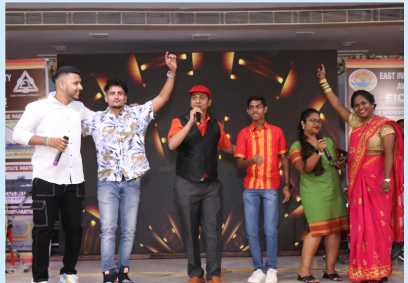
Performance Umbrachapani Urta Rap Song