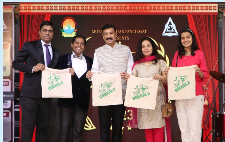
Release of the Sukhala eco-friendly Bag by Clauderricks Enterprises