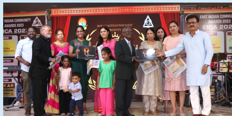
Presentation of Coffee table book - Viva Queimada for the School library of St. Lawrence Group of Schools

The Melbourne East Indian Association's commitment to preserving and sharing East Indian culture in Melbourne is commendable.