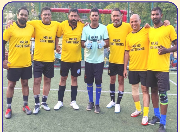
Malwani Gaothan Winners of Veterans Category