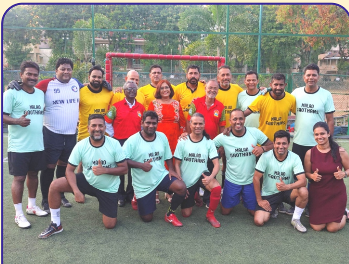
Mobai Premier League 2023 Finalist for Veterans Category