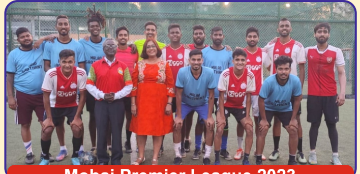
Mobai Premier League 2023 Finalist for Open Category