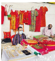
Lugra and other clothes on sale at the festival

IF you're a true East Indian (EI), the weekend is no time for slowing down and unwinding. No sir, we throw a party. And once a year, this party puts on the livery of a festival — bells, whistles and ghumats — because you would expect nothing less from a loud and proud community. This Saturday, the Mobai Gaothan Panchayat hosts its 14th annual East Indian Sann 2023, a three-in-one