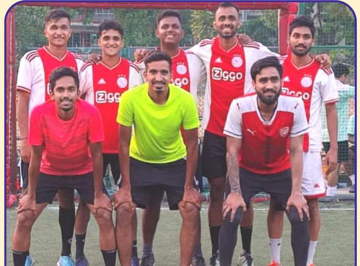
Vasai Gaothan Winners of Open Category