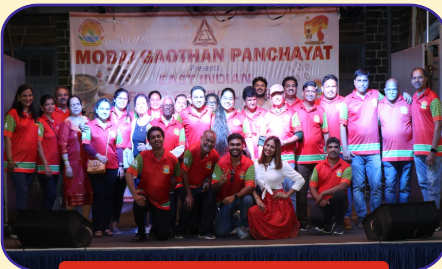
MGP Team at East Indian Sann 2023