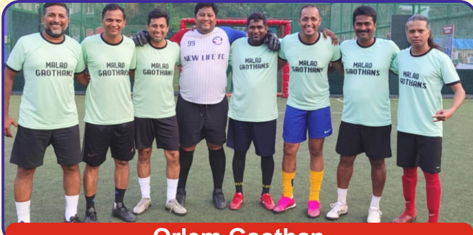
Orlem Gaothan Runners Up of Veterans Category