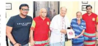
Members of community with Cardinal Oswald Gracias

The community traces its origins to religious conver-