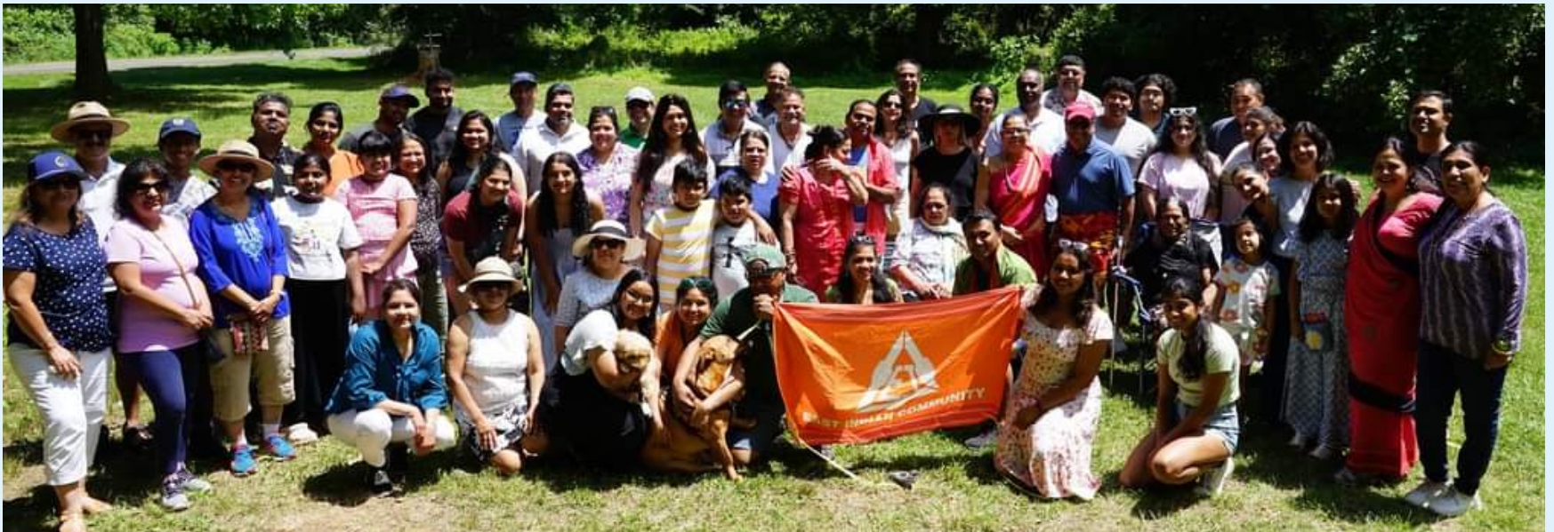
US Annual Picnic 2024 at New Jersey organised by East Indian Americas