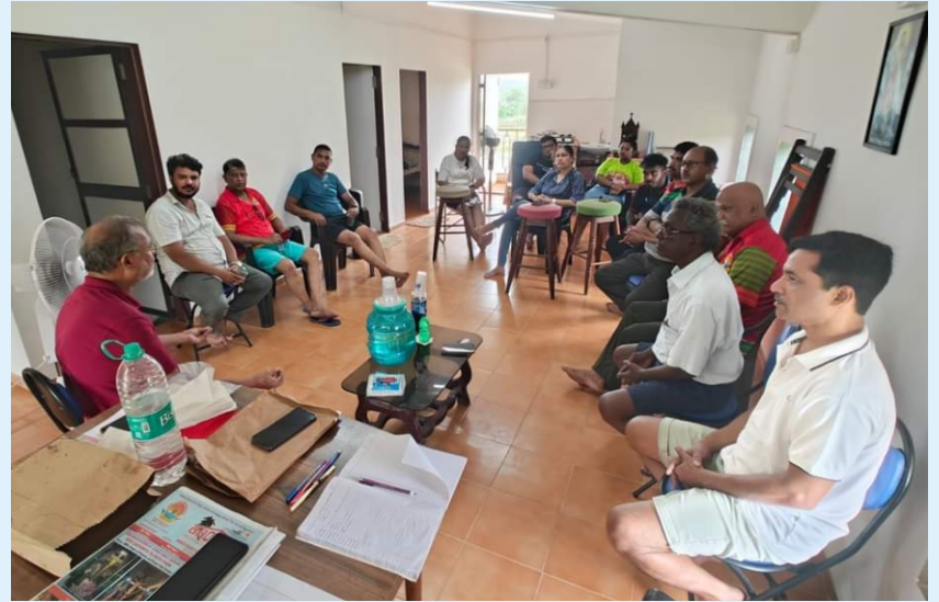
MGP Annual Offsite @ Uttan on Sunday, 30 th June 2024