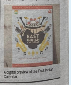
A digital preview of the East Indian Calendar

Listening to an East Indian tune or savouring one of the community's many delicacies are experiences that might be hard to forget. But the Santacruz-based Mobai Gaothan Panchayat is leaving no stone unturned in preserving these memories with the 2025 edition of The East Indian Calendar, dedicated to spotlighting these unique aspects of the culture. The theme for the new calendar is the origins of East Indian music and the way forward, marked by artist Chrysologus Dmello's illustrations of instruments including the ghumat (an age-old EI percussion instrument) on the cover. "Beyond the theme, one can also find lesser-known recipes from East Indian homes, and important dates such as Joseph 'Kaka' Baptista's (an activist and contemporary of Lokmanya Tilak) birth anniversary. This year we aim to take the calendar to 15 countries around the world," said chief co-ordinator Jamaica D'Lima. Those interested in getting their hands on the calendar can log on to mobaigaathanpanchayat .