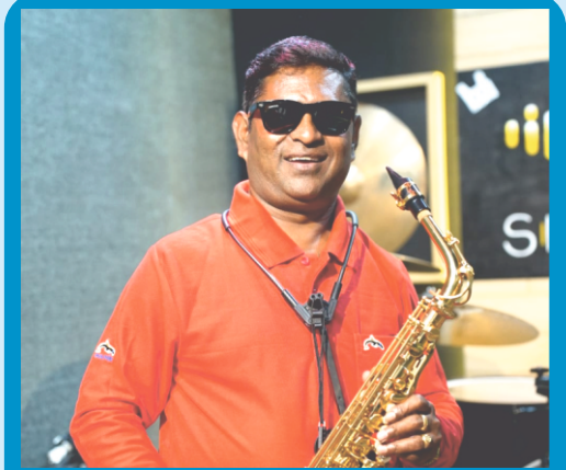
Valley Master - Jesus Band