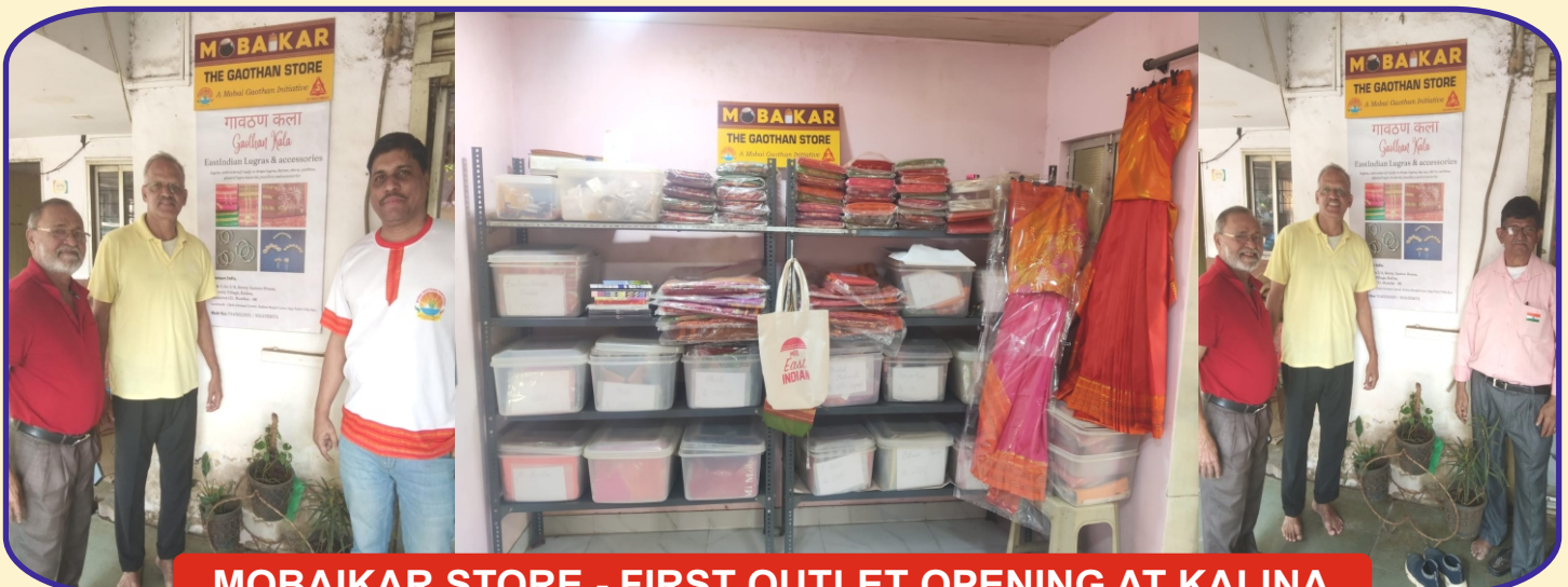
MOBAIKAR STORE - FIRST OUTLET OPENING AT KALINA