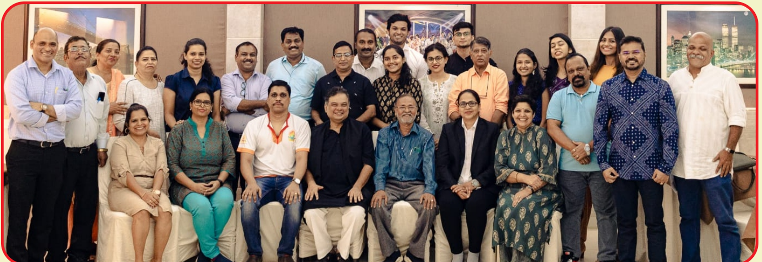
East Indian Conclave participants are all smiles after a successful and constructive Conclave