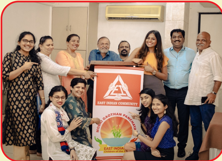
Conclave participants all smile after the successful Conclave