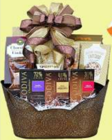
Christmas Gift Hamper