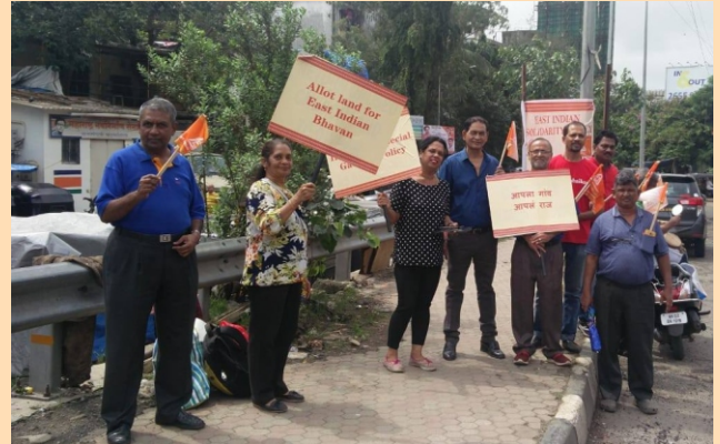
*Location 2 - Vakola* (right second) Assembly point - Western Express Highway, Near Vakola Signal