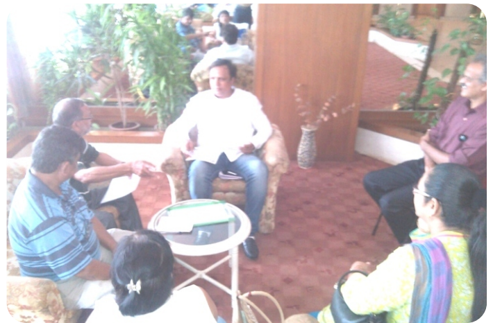
MGP delegation met Bandra West MLA and BJP Mumbai President, Adv. Ashish Shelar to discuss the demands of the East Indian community