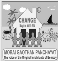
Illustration by - Chrys Demello Layout by - Shiv Mourya