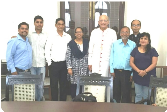
MGP delegation met Cardinal Oswald Gracias, Archbishop of Bombay to discuss East Indian community demands