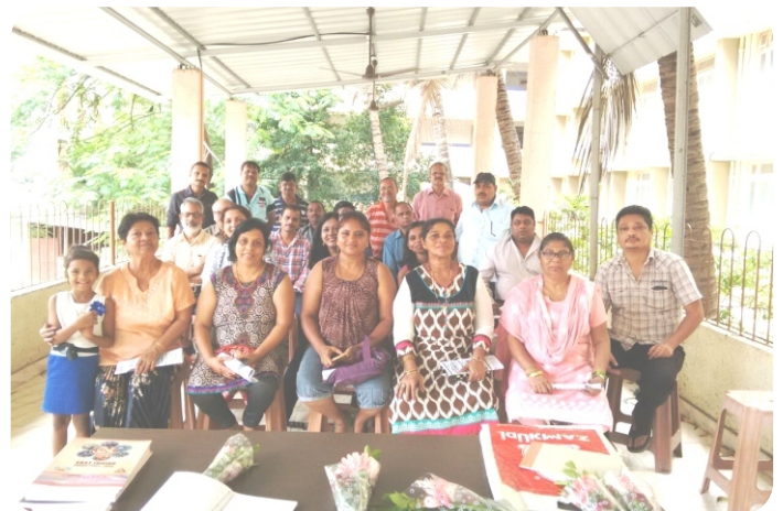
MGP visited Mira Road to meet local East Indians and guide them to form an East Indian Association for Mira Road