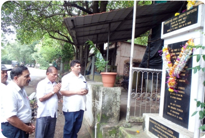
MGP Sarpanches of Gorai and local activists visited the Kaka Baptista Smarak, Uttan to pay their respects on Kaka Baptista's Death Anniversary