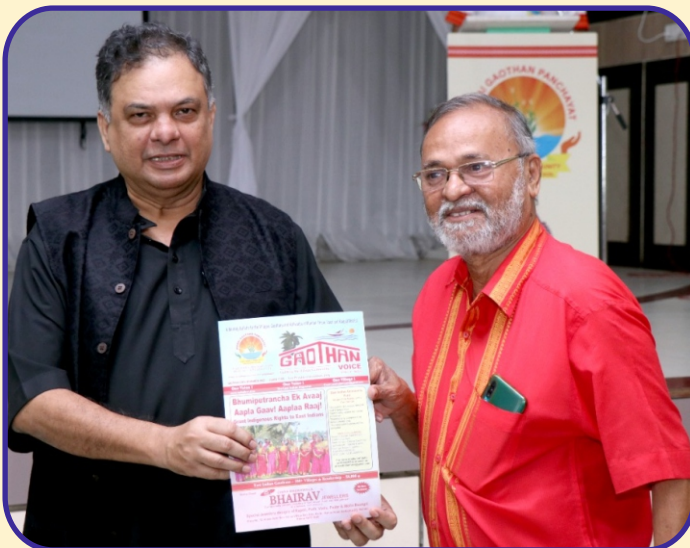
Conclave Release # 3