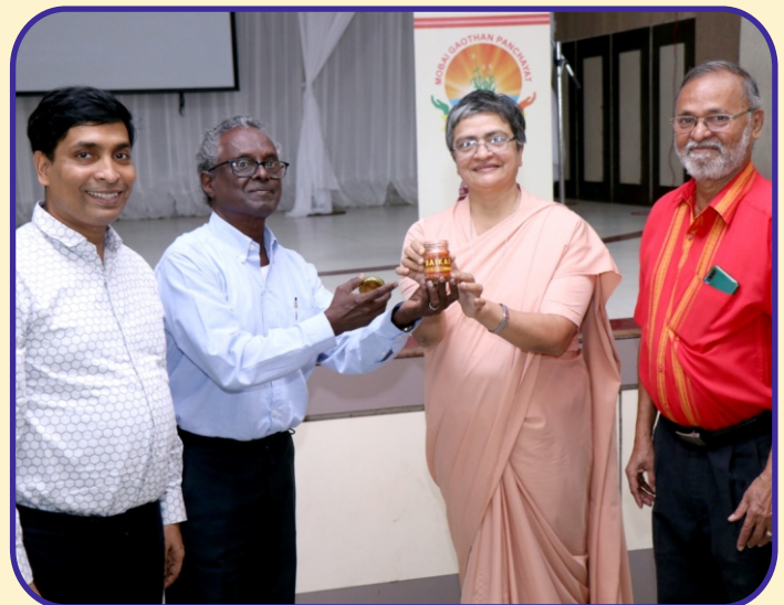
Conclave Release # 4