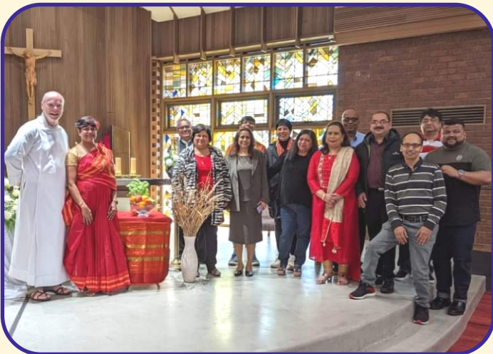
MELBOURNE - AUSTRALIA