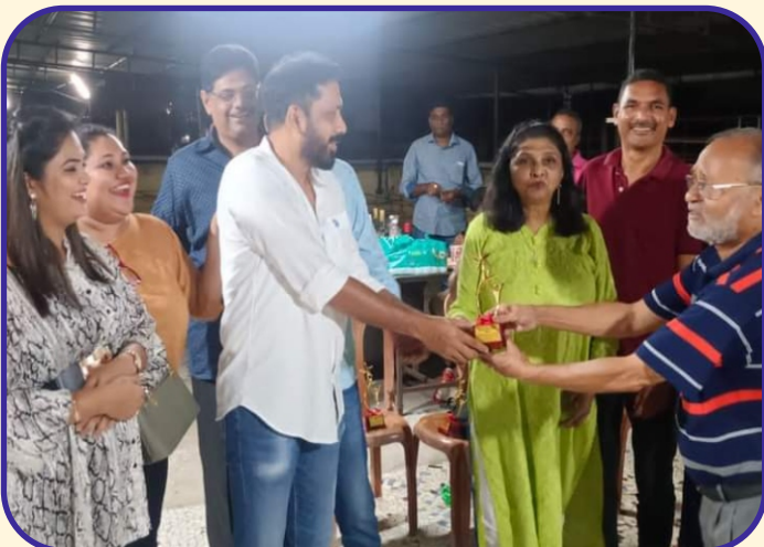
MALAD TEAM ACCEPTING THE AWARD FOR BEST UNITED GAOTHAN AGERA CELEBRATION