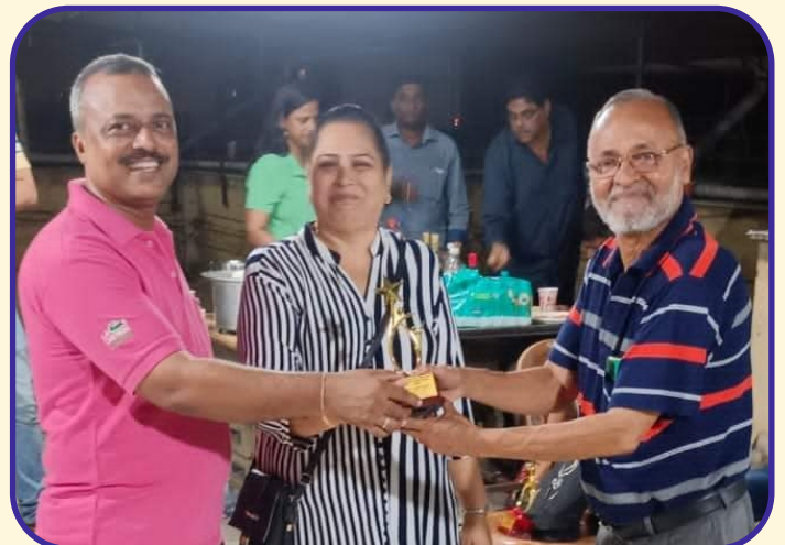
KURLA TEAM ACCEPTING THE AWARD FOR BEST AGERA EVENT 2022