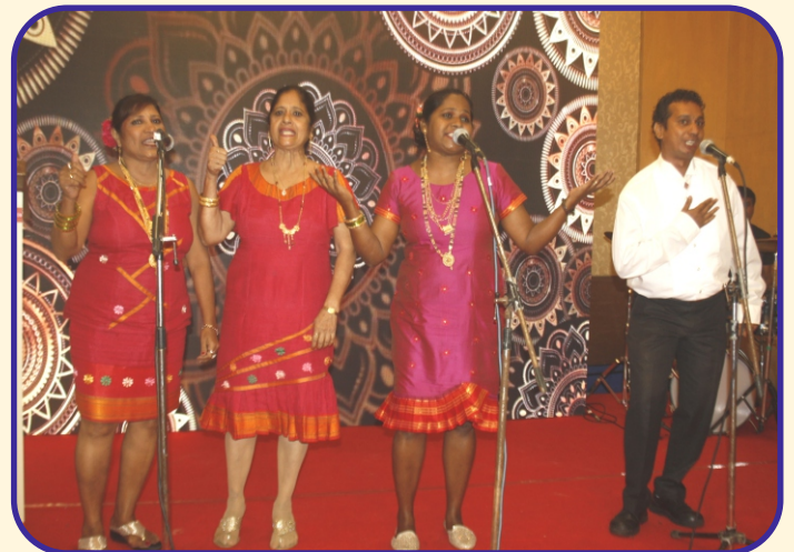
Kirol Cultural Troupe perform Mobaichi Asli Bhumi Putra