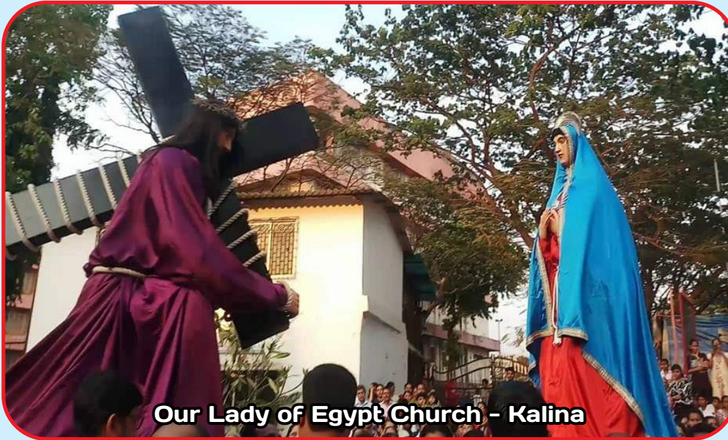
Our Lady of Egypt Church – Kalina