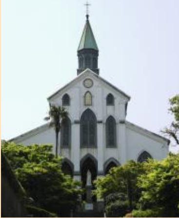
Basilica - Nagasaki

Our Saint Of The Soil - Saint Gonsalo Garcia